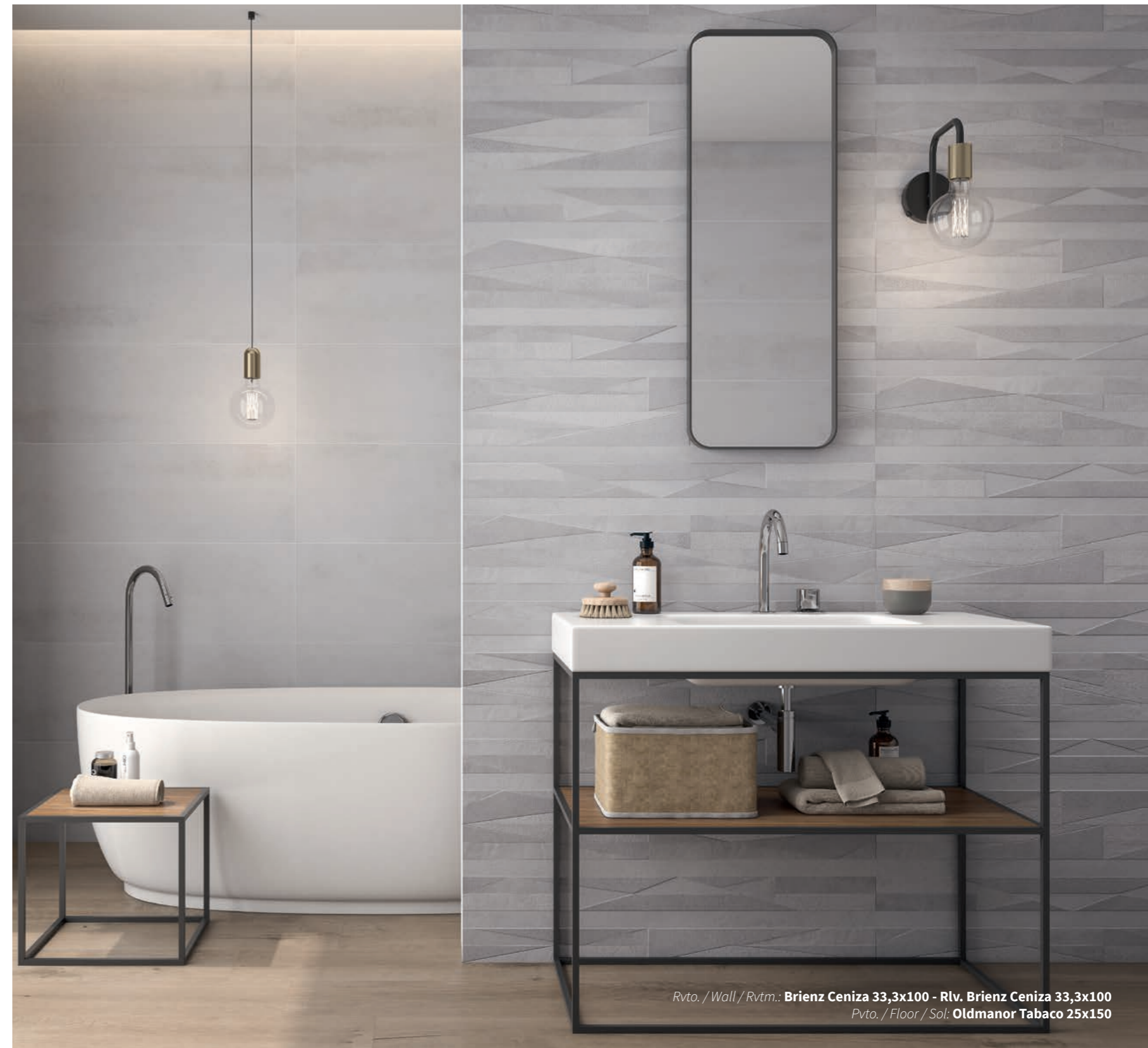
Rvto. / Wall / Rvrm.: Brienz Ceniza 33,3x100 - Rlv. Brienz Ceniza 33,3x100 Pvto. / Floor / Sol: Oldmanor Tabaco 25x150