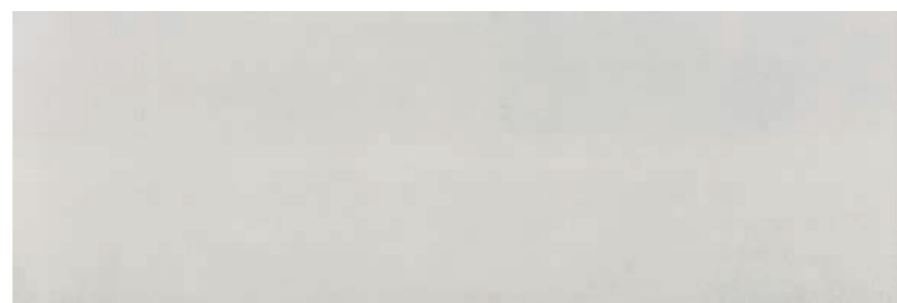
• Brienz Blanco 33,3x100 Rec. M48 031.627.0012.02985