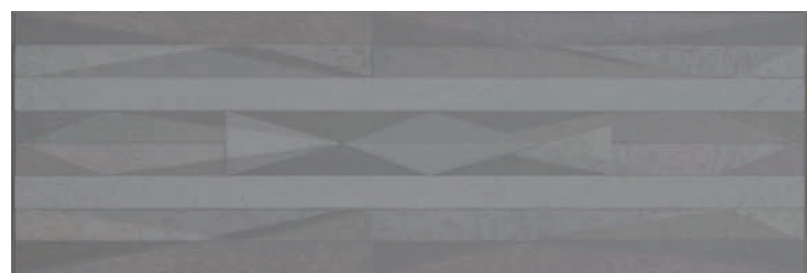
• Rlv. Brienz Marengo 33,3x100 Rec. M48 031.627.0028.03817