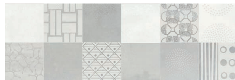
• Dec. Brienz Ceniza 33,3x100 Rec. M48 031.627.0019.03820