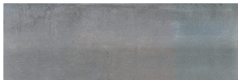
• Brienz Marengo 33,3x100 Rec. M48 031.627.0028.02985